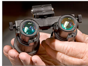
Enlarge

Posted 7/17/2008 11:02 PM | Comments 6 | Recommend 6 | E-mail | Save | Print | Reprints & Permissions | RSS